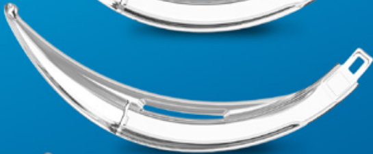
Macintosh Blade size 4