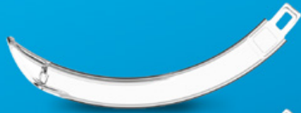
Macintosh Blade size 1