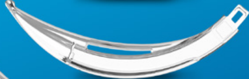
Macintosh Blade size 3