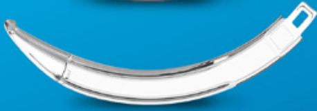
Macintosh Blade size 2